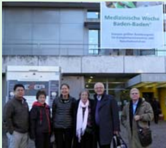
Here's part of the group gathering outside the Medicine Week Congress House