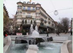
Beautiful Baden-Baden in the Fall!