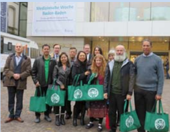
Here's part of the group gathering outside the Medicine Week Congress House