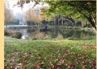
Beautiful Baden-Baden in the Fall!