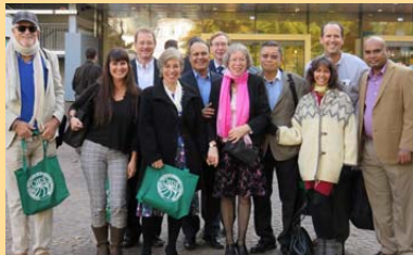
Here's part of the group gathering outside the Medicine Week Congress House