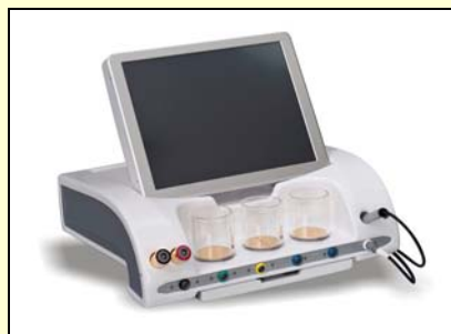
The MORA Nova by Med-Tronik