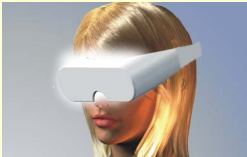
Intensive white radiation 9,000-14,000 lux wavelength 400-700 nm